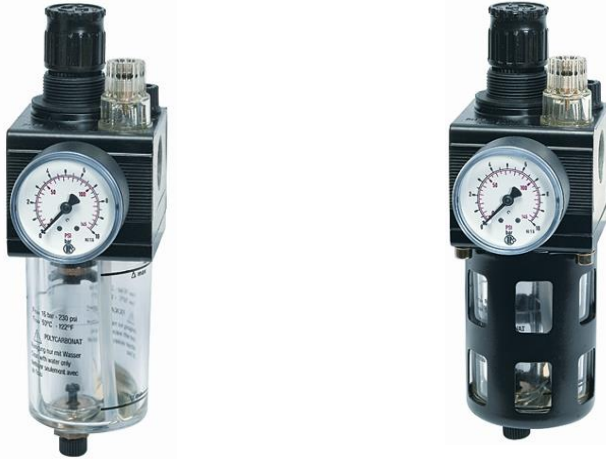
With bowl guard